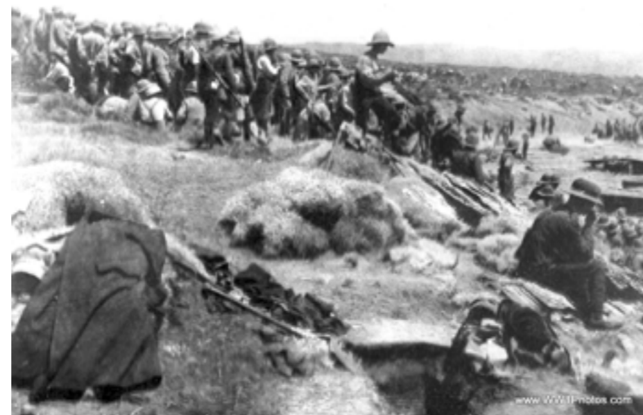
British troops on the beach at Suvla after the 6th August landings