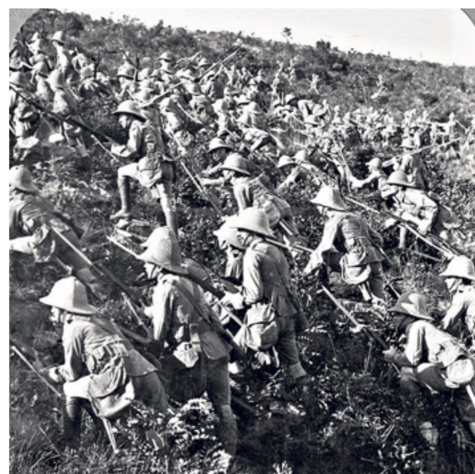
British troops on the hill behind Suvla